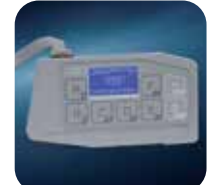
On-site tool HENRI+