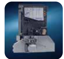
3-way sorter standard