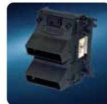
3-way high-speed sorter